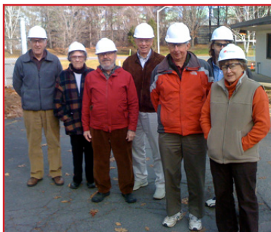
ILEAD members taking the course, Environmental Choices, Rethinking Nuclear Power, visited Vermont Yankee nuclear power plant.