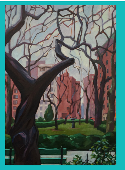
Images from the March/April gallery show "Still Seeing Green", which featured paintings by artist

The gallery is free to view during regular office hours: Mon-Thurs 8:30a to 4:30p Fri 8:30a to 1:00p