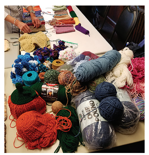
Donations of yarn for Gail's classes.