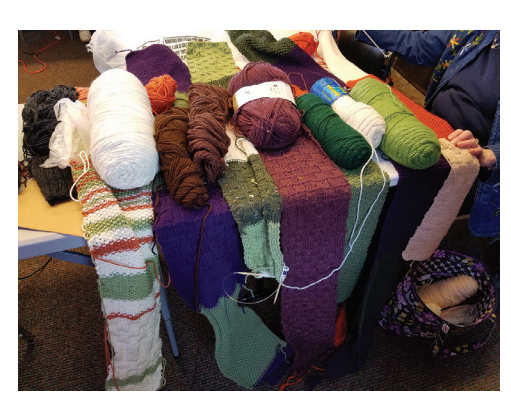
An assembly of materials and lengths of scarves cover a classroom table.

In addition to their work on donation projects, class participants trade lessons on different stitches and techniques. They have enjoyed presentations by guest lecturers about the health benefits of knitting and how to avoid overuse syndrome, a.k.a. repetitive strain injury. A local rancher stopped by to share information and stories about sheep farming. Gail is currently planning