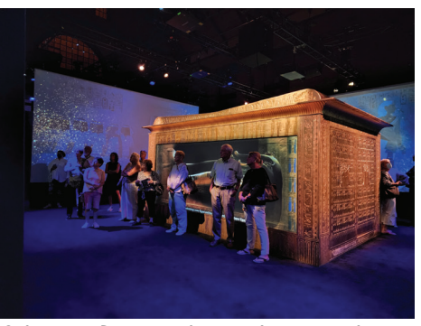
Osher at Dartmouth members stand near King Tut's sarcophagus as a narrator describes some of the features of the burial container.